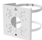
SN-CBK627D Pole Mount