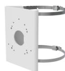
SN-CBK101 Pole Mount