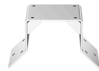
SN-BK407-SS Corner Mount