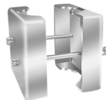
SN-BK406-SS Pole Mount