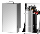
SN-CPL10A-SS Washing Tank