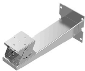
SN-BK401A-SS Wall Mount