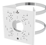
SN-CBK627D Pole Mount