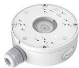
SN-CBK645G Junction Box