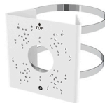
SN-CBK627D Pole Mount