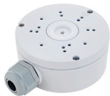
SN-CBK656A Junction Box