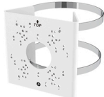
SN-CBK627D Pole Mount