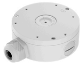
SN-CBK646M Junction Box