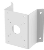
SN-CBK102 Corner Mount