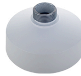
SN-CBK203 Pendant Cap