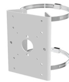
SN-CBK101 Pole Mount