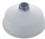
SN-CBK206 Pendant Cap