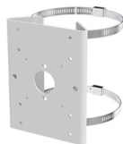
SN-CBK101 Pole Mount