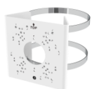
SN-CBK627D Pole Mount