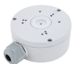
SN-CBK656B Junction Box